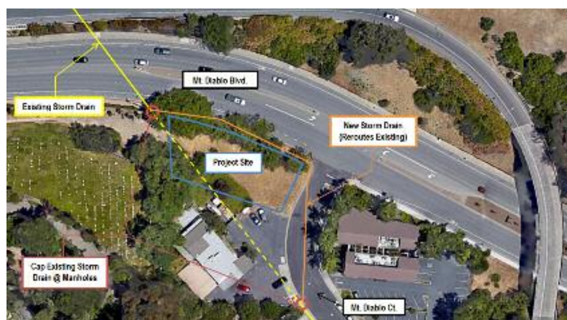
Image provided by EBMUD depicting location of existing and future storm drains.